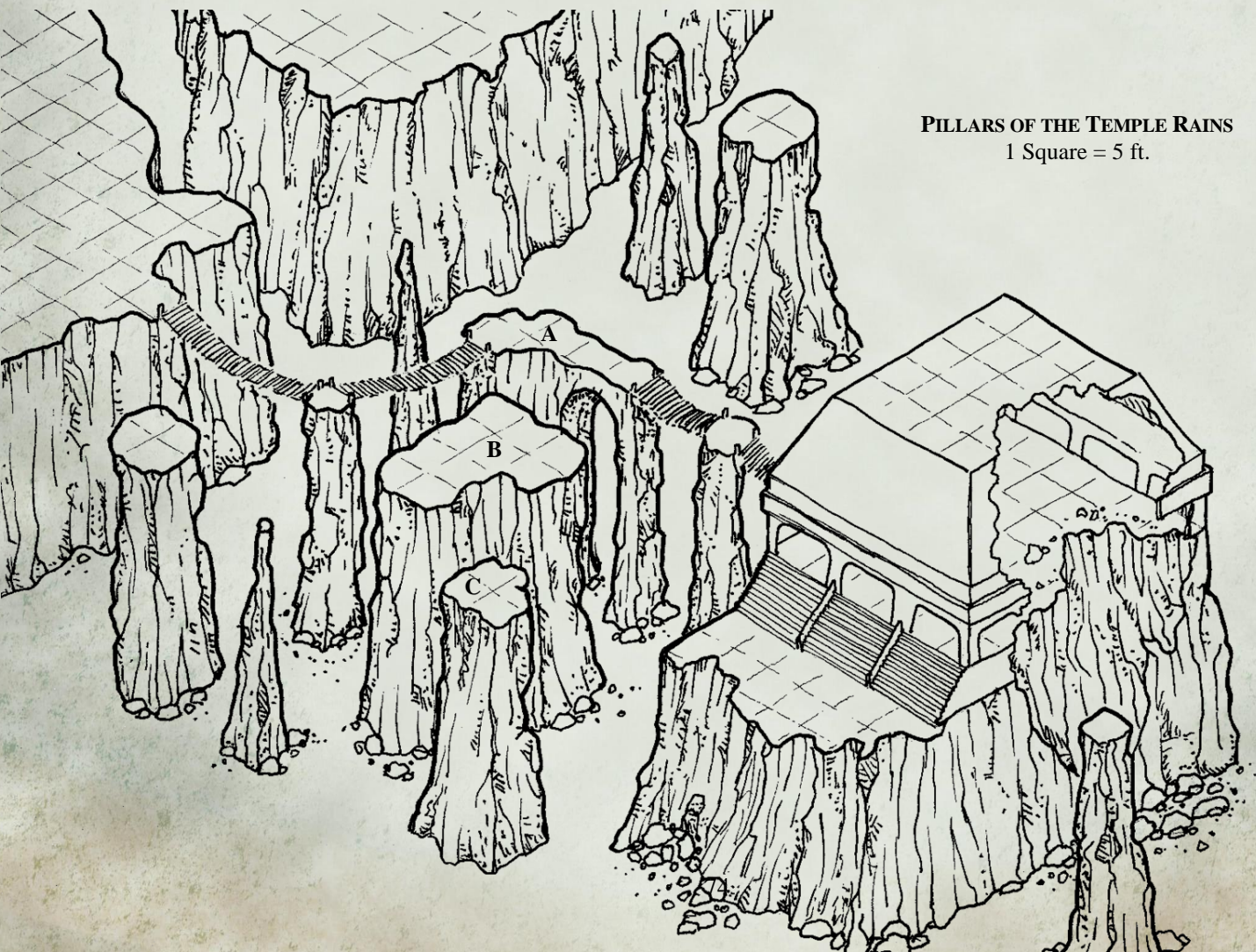
PILLARS OF THE TEMPLE RAINS 1 Square = 5 ft.